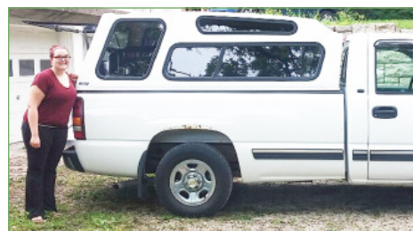
Ashley moves out of The Homestead.

If you would like to donate to this new fund, please go to our web site and note that your donation