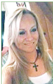
Pepper resides in Detroit, MI.

that can be so overwhelming and discouraging.