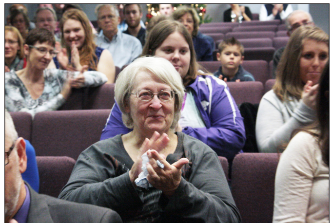
Proud house momma

Another huge accomplishment I've made is completing my job apprenticeship in Property Management. I love my job so much! I want to say a big thank you..."